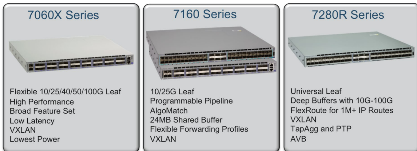
Figure 2: Arista Networks standards compliant 25G Switch portfolio

The 7280R series are a set of purpose built 10/25/40/50/100GbE fixed configuration 1RU and 2RU systems designed for the highest performance environments such as IP Storage, Content Delivery Networks, Data Center Interconnect and IP Peering. The 7280SR2-48YC6 offers 48 native 25G ports along with six 100G uplink ports. Other 7280R Series systems offer 4x25G support on QSFP 100G ports with the capability to mix and match 10/25/40/50/100G speeds.