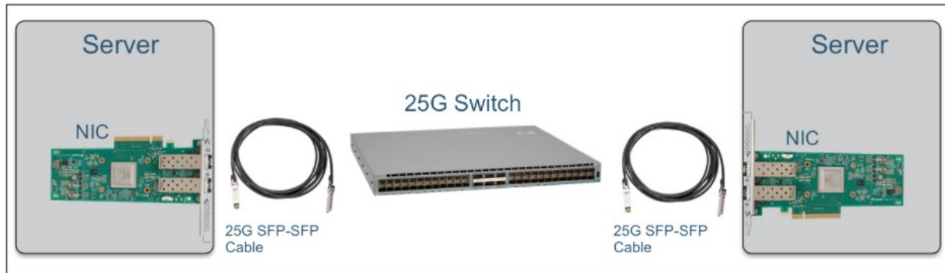
Figure 4: Test set-up for 25G Ethernet Switch-NIC interoperability testing

The Arista Switch is connected to two servers, each with Cavium 25G NIC cards. An iPERF server is used to generate traffic on one server, and data is transmitted through the Arista switch to the second server with an iPERF client. For connectivity, 3 and 5 meter SFP-SFP 25G Twinax copper cables and QSFP-4xSFP breakout cables were used (Figure 4).