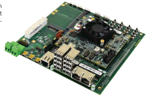
COM Express Development Platform

The OCTEON III CN70XX/CN71XX families of multi-core cnMIPS64 processors integrate single to quad cnMIPS64 v3 cores with virtualization capabilities and hypervisor support. These highly-integrated SoCs include a rich set of I/O's and Cavium's advanced hardware acceleration for packet processing, security, deep packet inspection (DPI), offering a power, performance, and price-optimized solution for next-generation platforms.