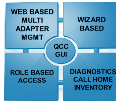
Figure 1. Key Features of the QCC GUI

The QCC GUI unified adapter management tool can be deployed on a management workstation or virtual machine (VM). It communicates with management agents residing on servers with FastLinQ and QLogic adapters over a secure channel via HTTPS. Access to QCC is available via any of the supported browsers by pointing the browser to the IP address of the management workstation or VM where QCC is installed. The management agents can be installed on servers with QLogic adapters using SI in Windows and Linux environments.