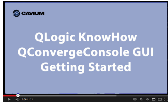
Click on the Image to Watch a YouTube Video

Related Video: QLogic KnowHow: QConvergeConsole GUI: Getting Started