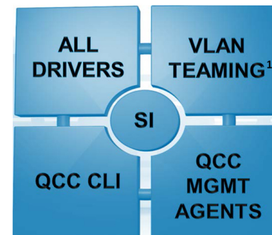
Figure 3. Components of SuperInstaller (SI)